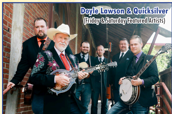
Doyle Lawson & Quicksilver (Friday & Saturday Featured Artists)