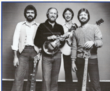
ORIGINAL Doyle Lawson & Quicksilver (Thursday, 24th)