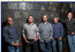
Lonesome River Band (Friday, 25th)