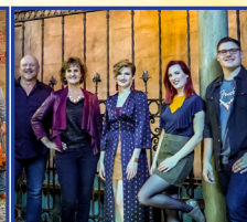
Trinity River Band (Thursday, 24th)