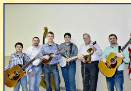
Jus' Cauz (Friday, 25th)