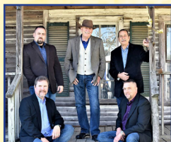
Deeper Shade of Blue (Saturday, 26th)