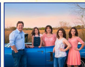
Williamson Branch (Saturday, 26th)