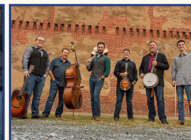
Sideline (Saturday, 26th)