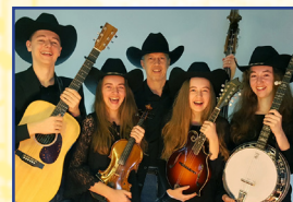
Mountain Highway (Friday, 25th)