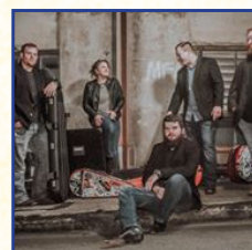
Drive Time (Saturday, 26th)