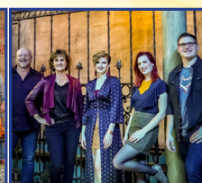
Trinity River Band (Thursday, 24th)