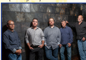
Lonesome River Band (Friday, 25th)