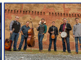
Sideline (Saturday, 26th)