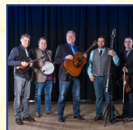
Illrd Tyme Out (Saturday, 26th)