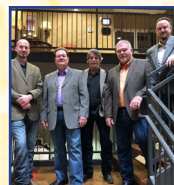
Fast Track (Thursday, 24th)