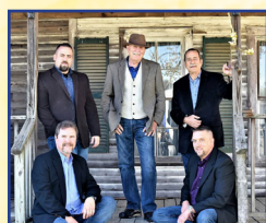
Deeper Shade of Blue (Saturday, 26th)