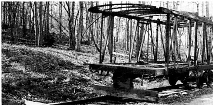
Above: Believe it or not, that was the caboose when it arrives at the park. A time-consuming dirty job removed rust and grime from wheels, bed and steel framing that remained. At right, in the park's restoration building: Walls are replaced, inside and out, with doors and windows framed, and it looks like a caboose again.