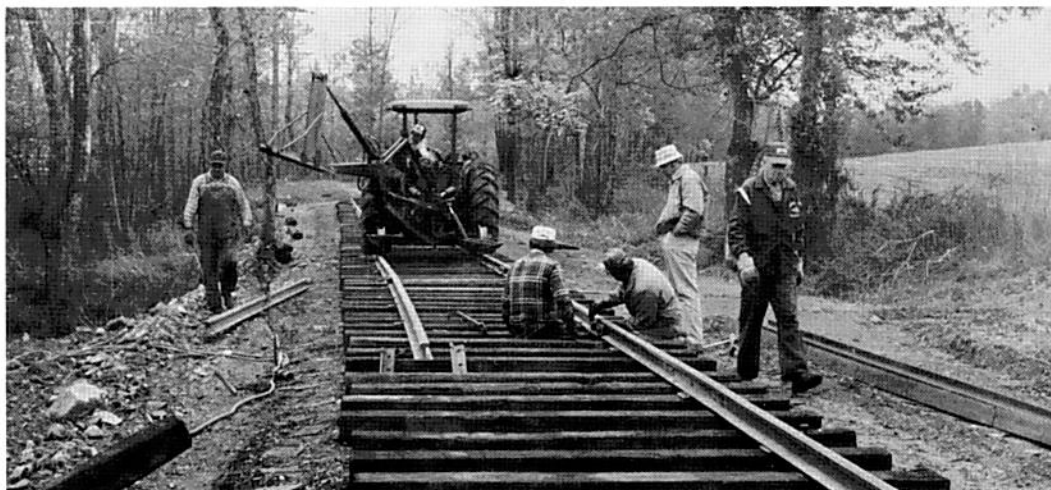
At left: Spring is bustin' out in 1982, and so is the Handy Dandy Railroad as grading, crossties and rails make way for the start of a railroad's life at that year's Threshers' Reunion. Why Handy Dandy? The park is in the Handy community of Davidson County, with one entrance from Handy Road. In these parts, it's still fashionable to name a baby for its ancestry.