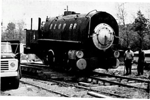
MAY, 1979: With tracks laid for loading, engine and wheels are placed on truck (above) at the locomotive's longtime resting place at Burnsville, N.C., in Yancey County. At right: Completing a route selected by the N.C. Department of Transportation to avoid low-hanging bridges, the dismantled locomotive arrives at Denton Airport.