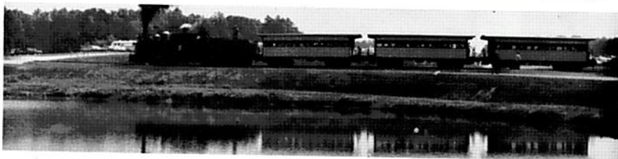
1983: Third passenger car became part of scene reflected in lake.