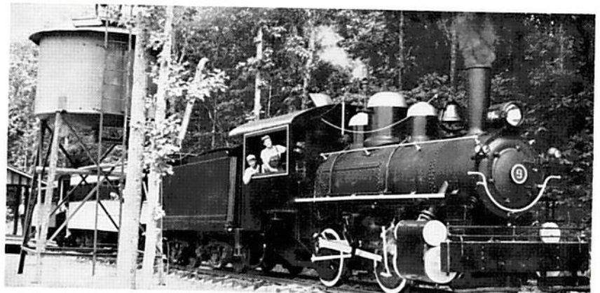
1982: Engine got face-lift with sand pots, bell, light and steam dome cover; tender car and second passenger car were added; and 1½-mile track was completed.