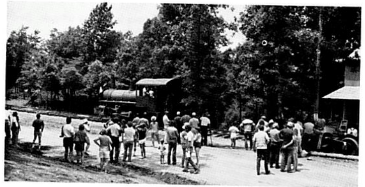
109 via Handy Road and Cranford Road. At right: In 1980, moving under its own power for the first time in three decades, the locomotive ran back-and-forth on a 200-foot straight section of track in the present area of the train shed.