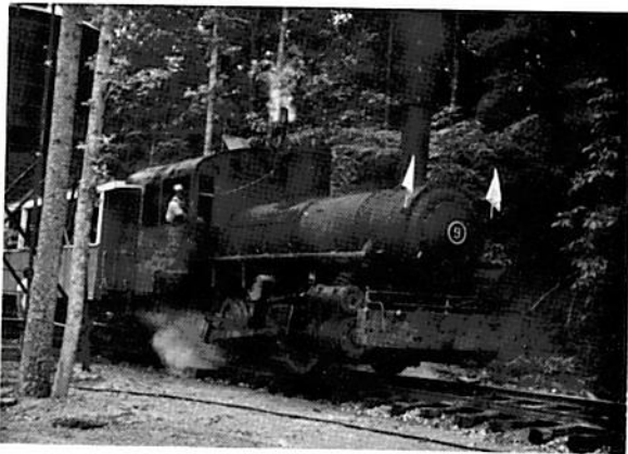
1981: A passenger car was added; length of track was increased to 1,500 feet; and a water tank was erected.