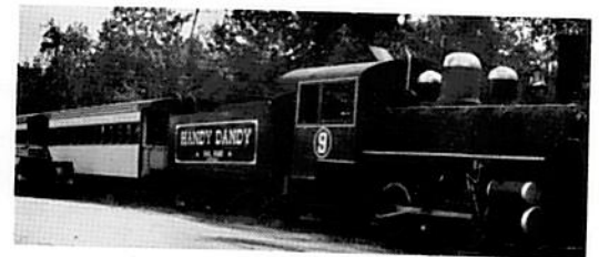
1984: Tender car was decorated with name.